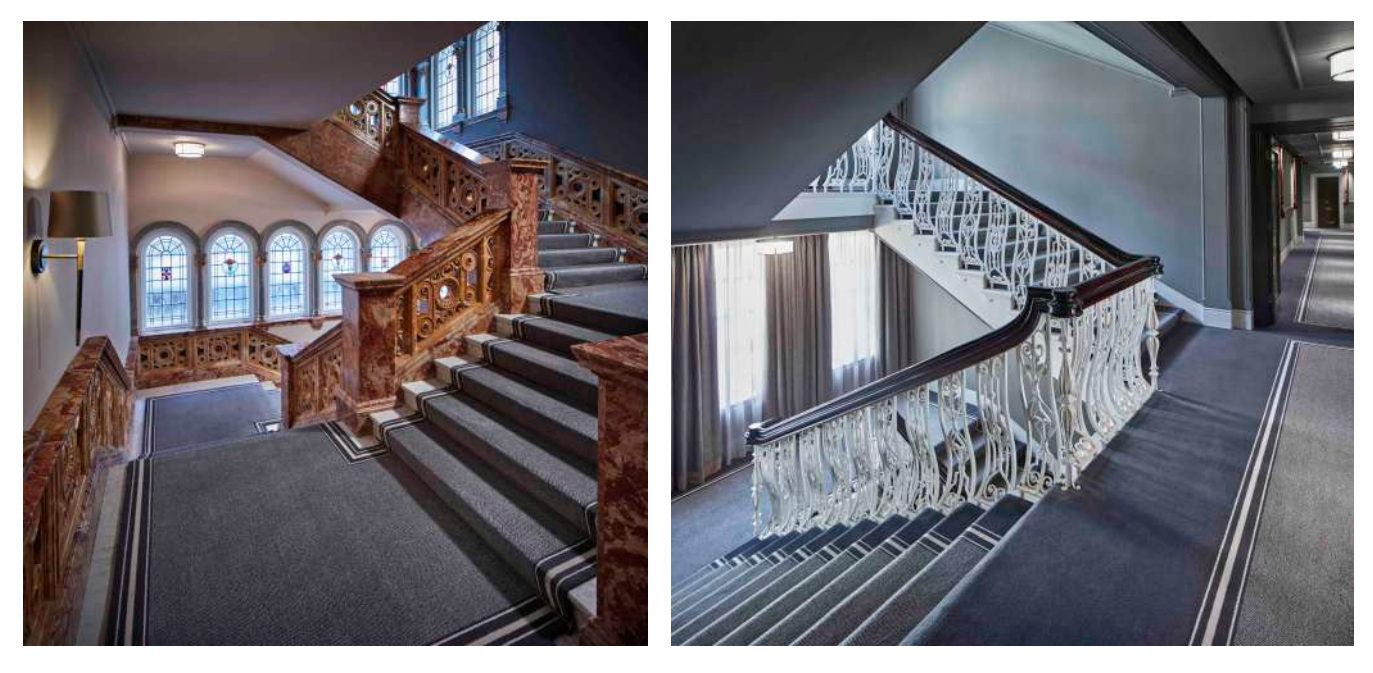
Two of the staircases in The Principal London, both featuring Brintons custom carpets