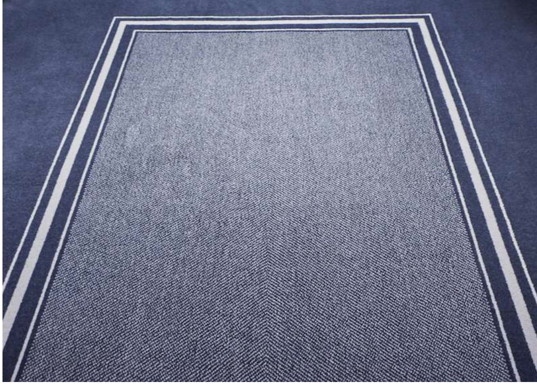
A close up of the bespoke herringbone carpet design in The Principal London