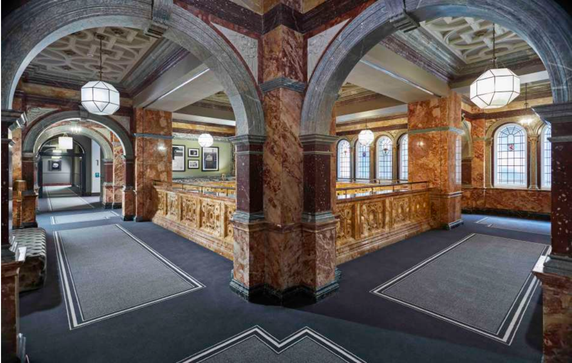
Bespoke Brintons carpet featured in the upper floor corridors and gallery of The Principal London

Brintons supplied carpets for key public areas within the five-star hotel The Principal London, a Grade II listed landmark building, which dominates the eastern flank of Russell Square in Bloomsbury. The Principal London re-opened in April 2018 after undergoing a multi-million pound renovation.