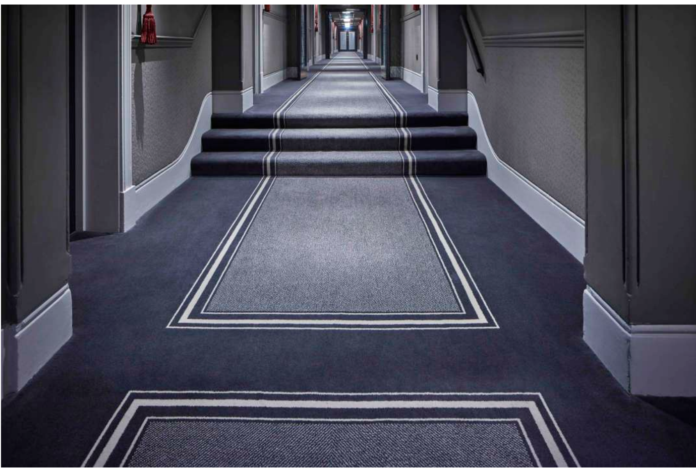
Custom Brintons carpets in the main hallway on an upper floor of The Principal London