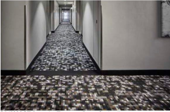
3/X5228CZ from the Zuzunaga Deep Grid collection