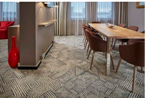
X5830IN from the Inspirations Collection