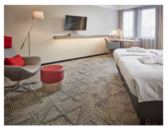
X5830IN from the Inspirations Collection