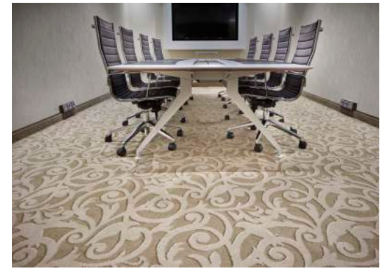
Gold Atholl Gardens design from the Timorous Beasties Collection