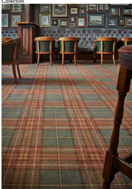
Cavan Plaid from the Abbeyglen collection