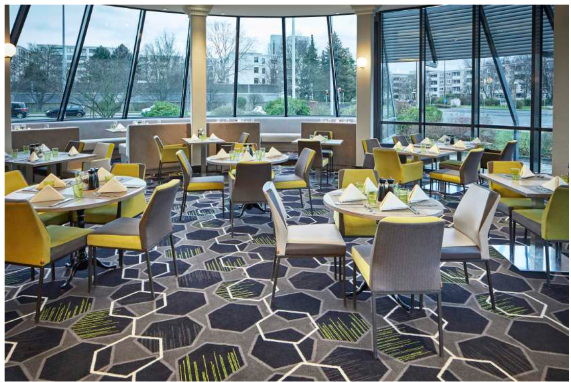
Winter Garden - custom Brintons design

Internationally renowned H4 Hotels have commissioned premium carpet manufacturer Brintons to design carpets for luxury 4 star hotel, Hannover Messe. Strongly influenced by the close proximity to Hannover's business centre, Brintons created carpets to suit the modern feel combined with structures and textures of nature.