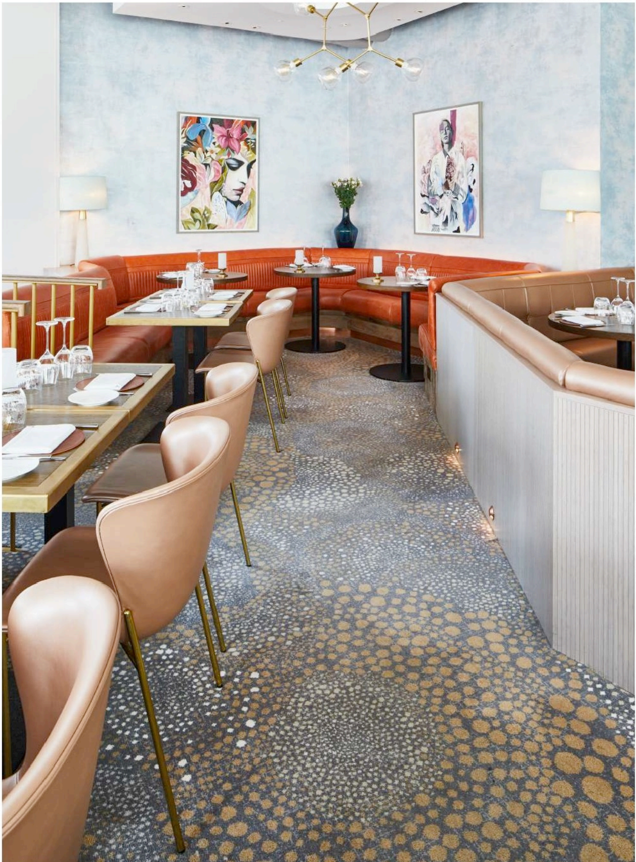
Brintons' bespoke carpets contribute to Aster's inviting ambience created by Russell Sage Studio