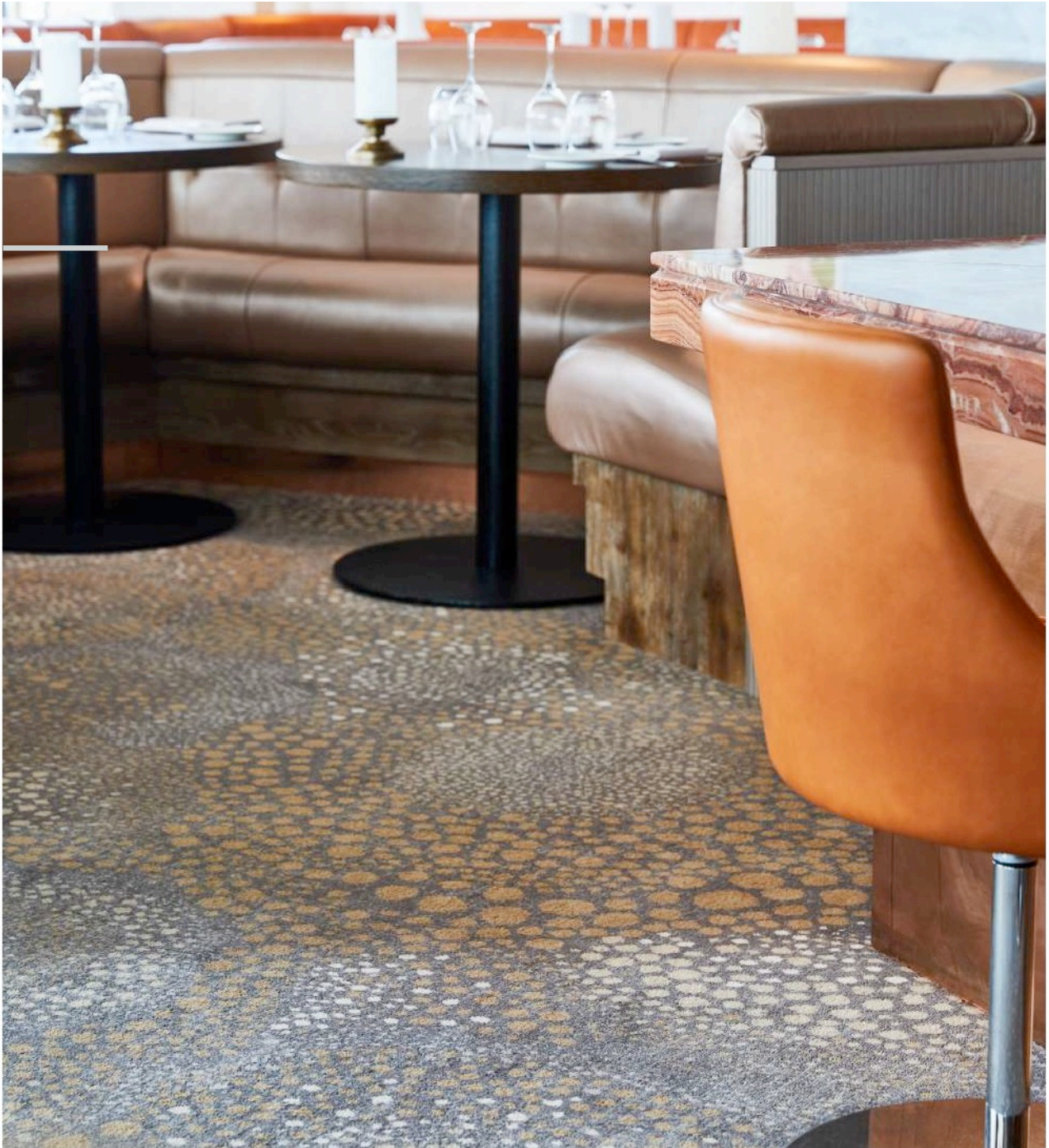
A dose up of Brintons' repeat dotted design in the Aster restaurant in Victoria, London