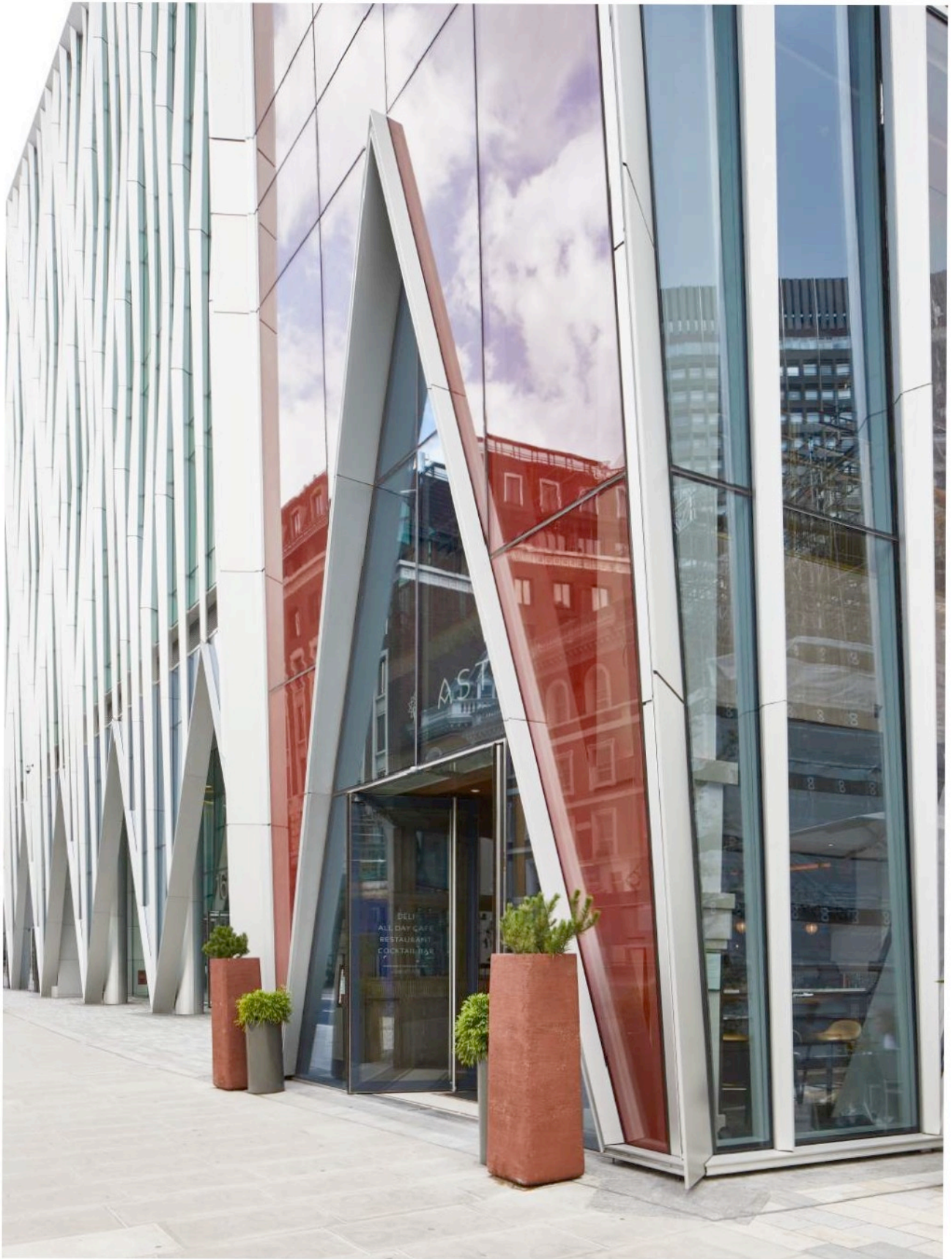
The exterior of Aster In central London, which features bespoke Brintons carpets