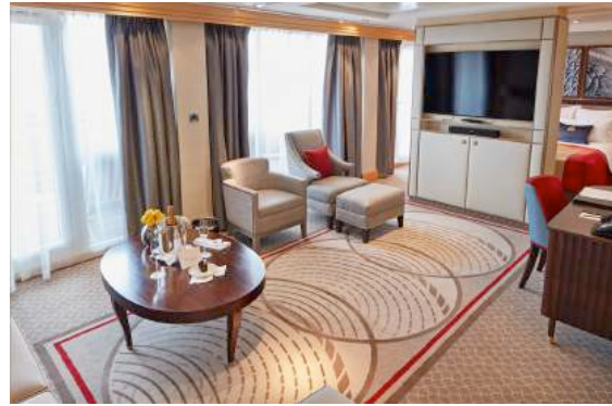
Above from left: Queen Mary II Champagne Bar, Penthouse