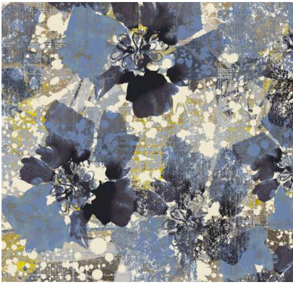
Stacy Garcia Collection, Q01/A04269ZSG