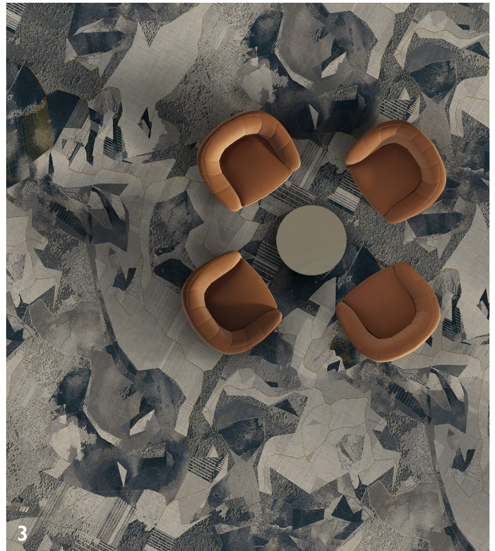
Pictured 1: Original artwork by Katie Nehrbauser | Pictured 2 & 3: Design Q03/A066 | 19WA