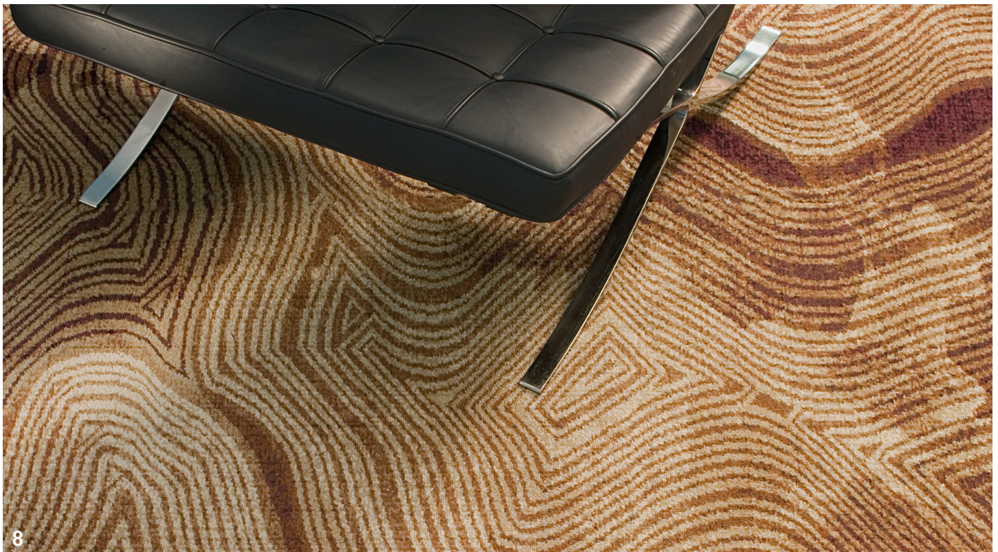
Pictured 7 & 8: Design Q02/A065814WA