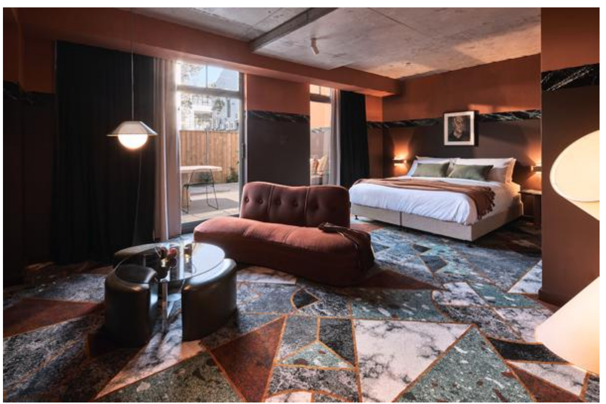
Brintons' Composite Collection featured in the Collectionist Hotel in Sydney

Unusual geometries, graphic patterns, and architecture-inspired shapes feature in the collection. The playful influence of materials such as terrazzo, concrete, marble, and mother of pearl are the designer's trademark and have been cleverly woven into Composite. The collection skilfully marries Studio Elke's striking materiality and textures, with Brintons' timeless, premium woven Axminster carpet.