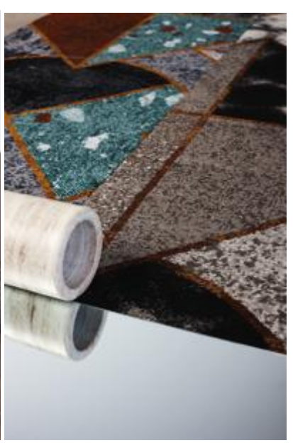
From left: Musk Nucleus, Power of Symmetry, and Jasper Thunder Below designs from Brinton's Composite Collection