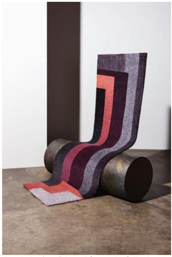
From left: Sorceress and Sorcerer designs, and Arches design from Brintons' Composite Collection

Known for its unique jewellery and accessories, Studio Elke is an industry leader in the fashion and design worlds. The studio is respected for its emphasis on pushing the boundaries of originality and its exploration of unique materials, experimental fabrications and new forms.