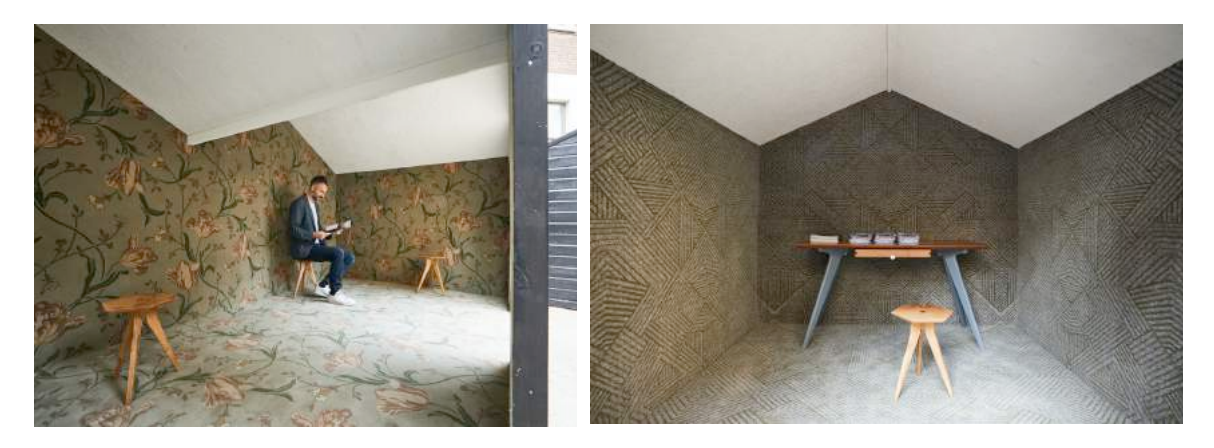
Brintons carpet-lined sheds, 132 Goswell Road at Clerkenwell Design Week 2017