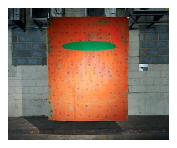
Joe Versus the Volcano by Shezad Darwood (2017), woven by Brintons