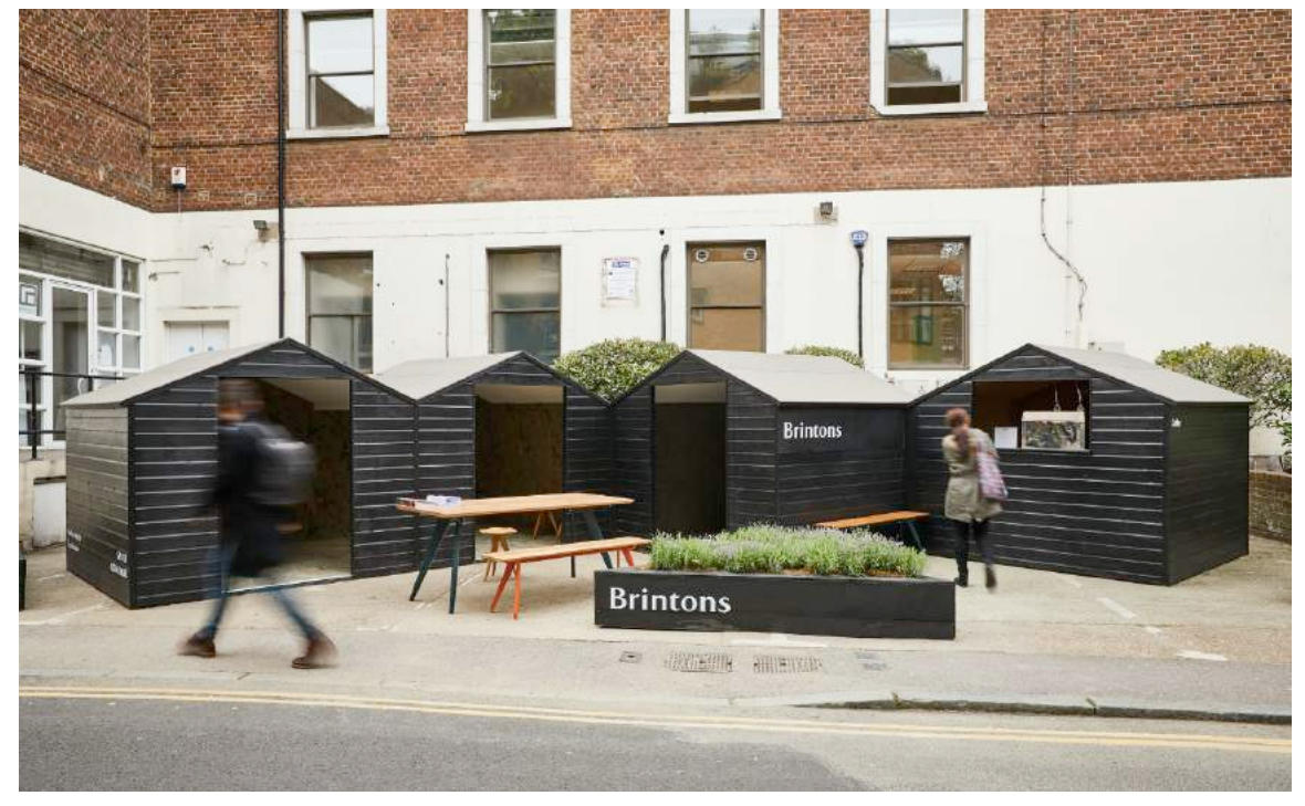
Brintons pop-up showroom, 132 Goswell Road at Clerkenwell Design Week 2017