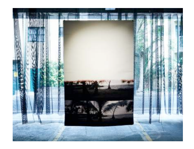
Multiple White-Out Palms by Shezad Darwood (2017), woven by Brintons