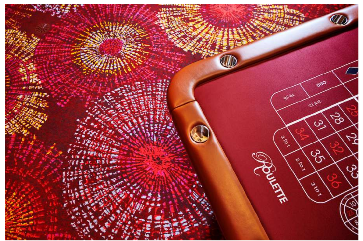
Brintons worked closely with international architecture practice Steelman Partners to bring a classic aesthetic to the Holland Casino Rotterdam