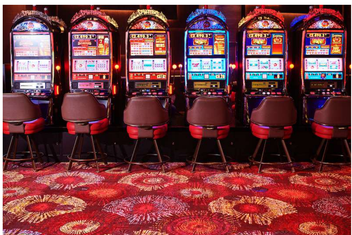
Bespoke Brintons carpet featured in the gaming area of the Holland Casino Rotterdam