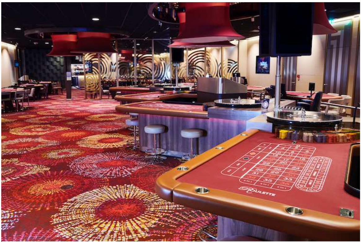
Brintons provided carpets for the gaming areas throughout the Holland Casino Rotterdam

Brintons created bespoke carpets for the entertainment and gaming complex Holland Casino Rotterdam, combining the practical benefits of the tile format with the aesthetic demands of a highend venue in one solution.