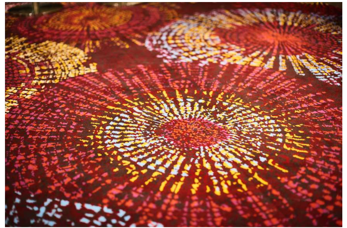
Brintons have used a warm colour palette with turquoise accents for the carpet design in the Holland Casino Rotterdam