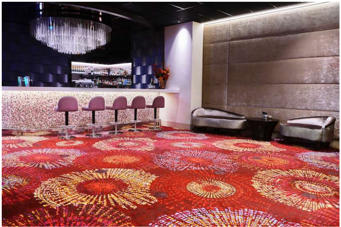
Bespoke Brintons carpet featured in the bar of the Holland Casino Rotterdam