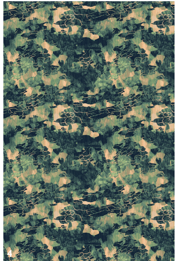
Pictured 2: Design Q01/A073972FL | Pictured 3: Design Q01/A073974FL | Pictured 4: Design Q01/A073417FL