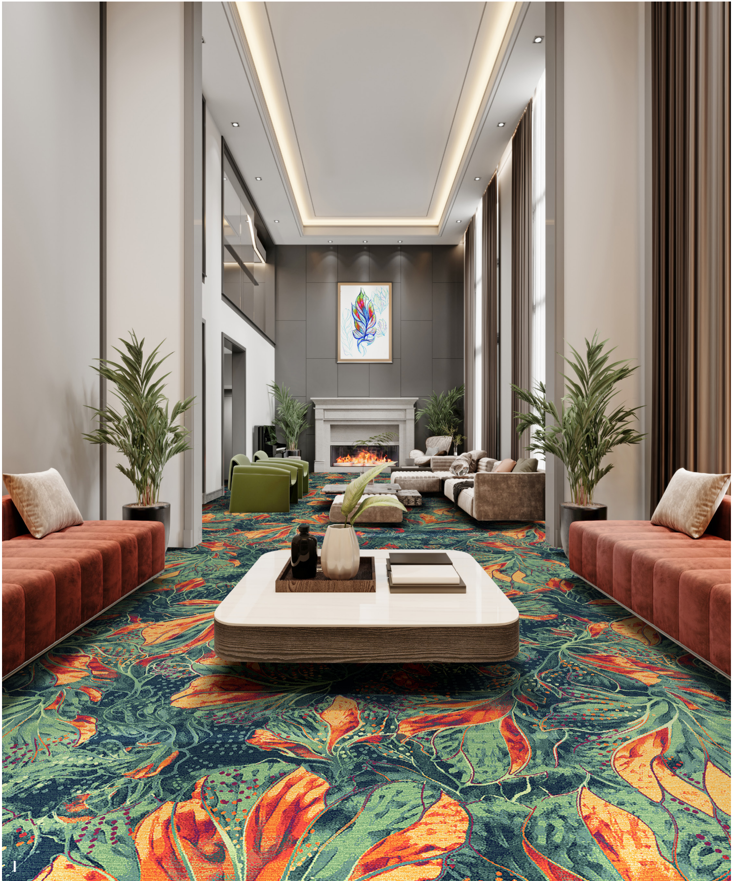
Pictured 1: Design Q01/A073416FL