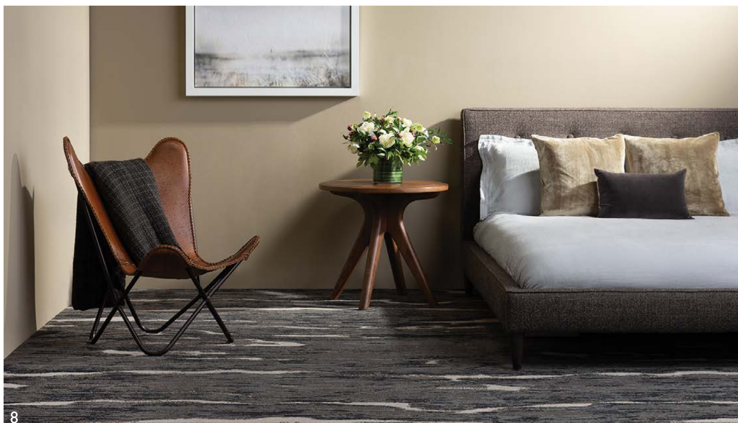
Pictured 7: Brintons machine tufted Infinity design: Pictured 8: Brintons machine tufted ColorPoint design: