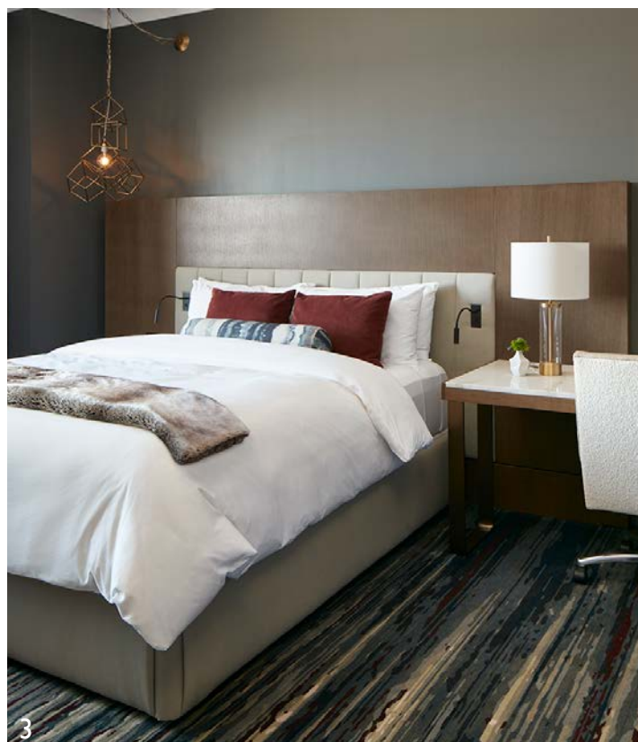
Pictured 1: Brintons hand tufted in suite. Pictured 2: Brintons hand tufted rug (Q01/A050141HT): Pictured 3: Brintons Axminster broadloom in guest room.