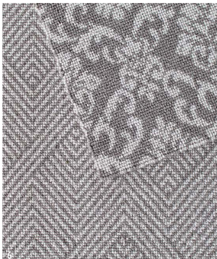
Pictured 4: Brintons 100% loop wilton in Boston guest room. Pictured 5: Brintons cut & loop wilton in DC suite. Pictured 6: 100% loop wilton designs: